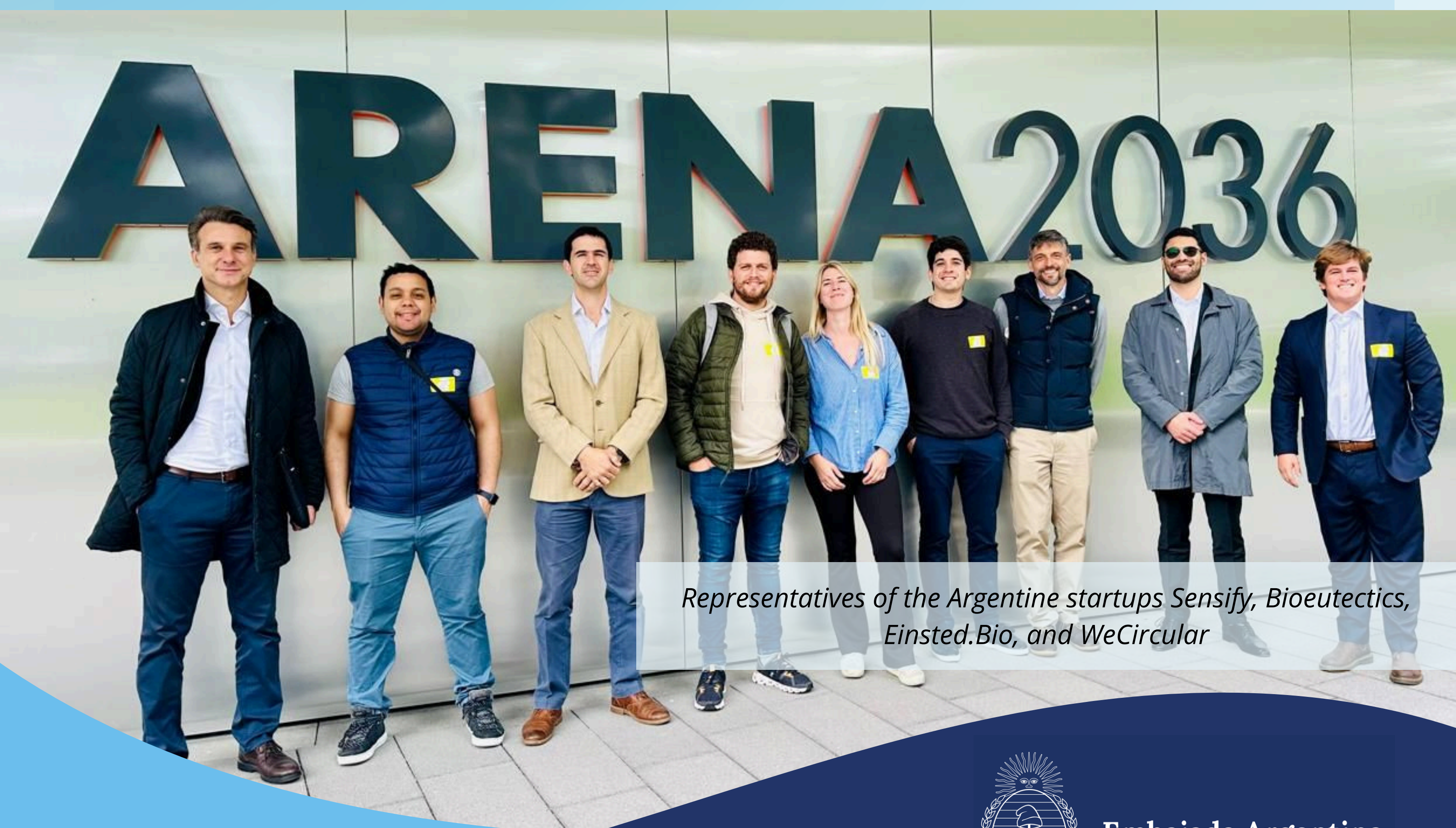
Representatives of the Argentine startups Sensify, Bioeutectics, Einsted.Bio, and WeCircular

This forum allowed the Argentine startups Sensify, Bioeutectics, Einsted.bio, and WeCircular to present their technological solutions in areas such as biotechnology, the Internet of Things, climate technologies, and sustainability applied to industry. With the support of the Argentine Embassy in Germany and German Accelerator, the entrepreneurs not only attended presentations on emerging trends and successful case studies, but also established connections with investors and innovation experts.