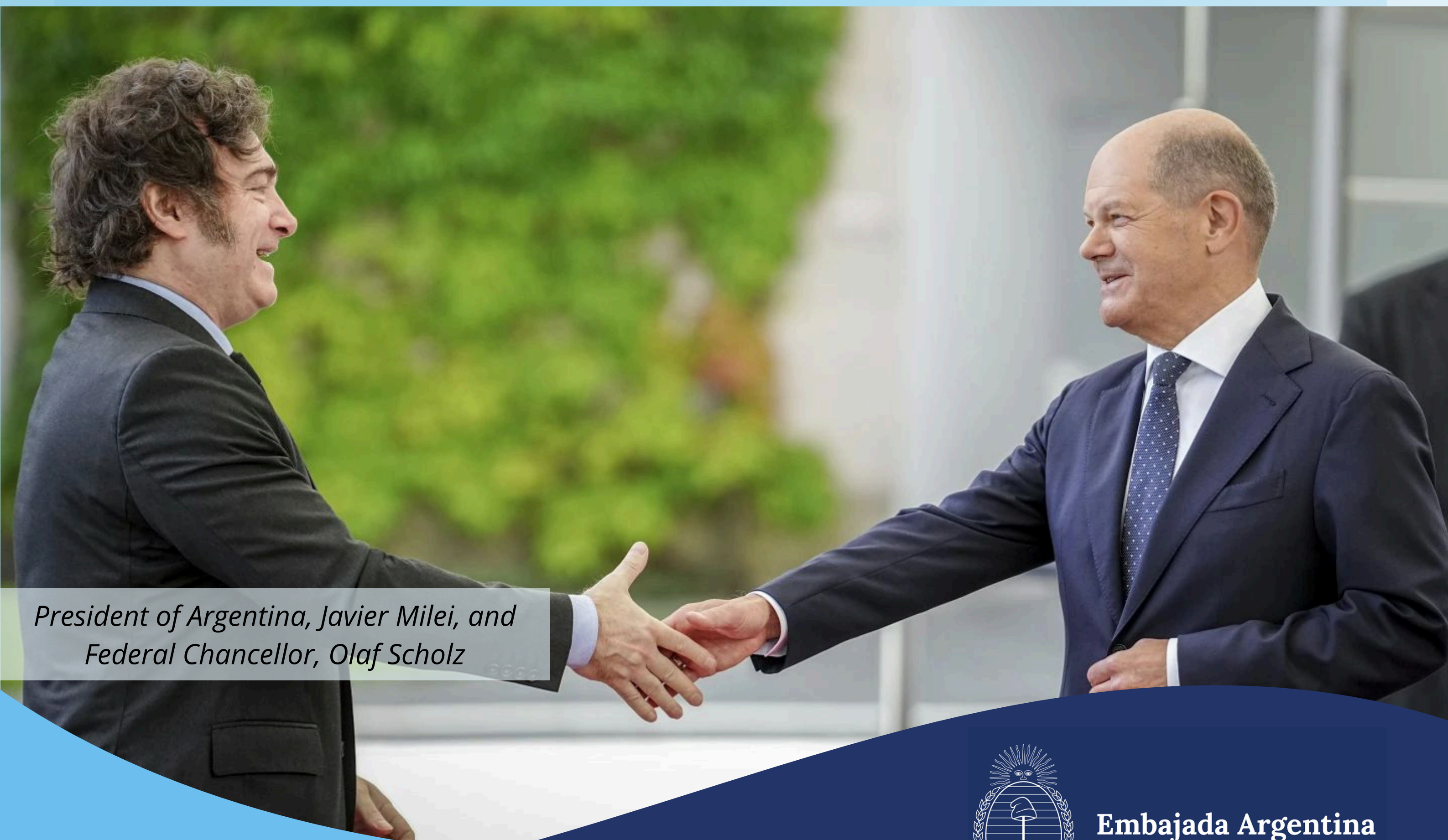
President of Argentina, Javier Milei, and Federal Chancellor, Olaf Scholz

Key topics on the agenda included free trade, energy security, critical minerals, defense of democracy, steadfast support for Ukraine and Israel, global architecture, investment, the knowledge economy, and artificial intelligence. Additionally, Argentina's accession process to the OECD, the impact of the EU-Mercosur Agreement, and the investment opportunities arising from the Global Investment Incentive Regime (RIGI) as a framework for legal stability to attract FDI were focal issues of conversation among leaders.